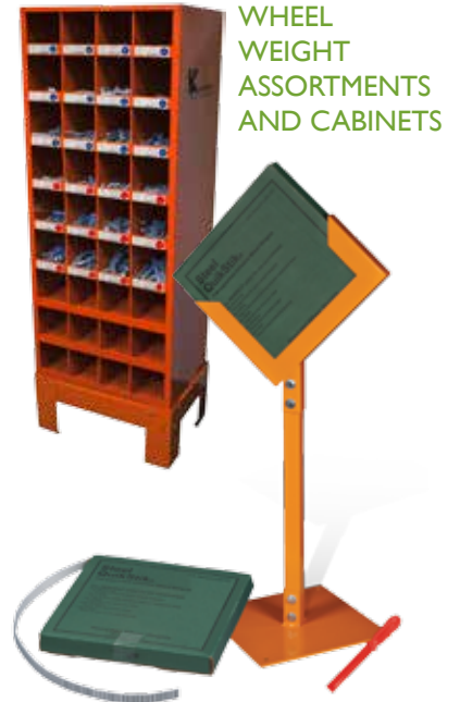
WHEEL WEIGHT ASSORTMENTS AND CABINETS