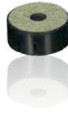
ROTOR SILENCER PADS (AMMCO TYPE)