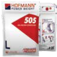
TIRE BALANCING COMPOUND FOR HEAVY-DUTY VEHICLES