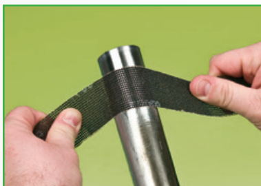
Screen mesh is impregnated with silicon carbide