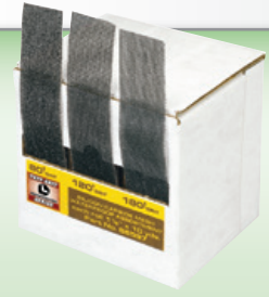
Assortment Pack 88597