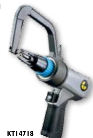
© 2018 Kent Automotive. All rights reserved. Printed in USA