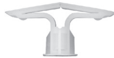
Large TOGGLER® Screw Anchor 5/8 – 3/4 Grip Range 5/16 Drill Size