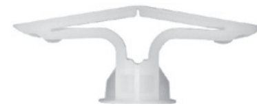
Medium TOGGLER® Screw Anchor 3/8 – 1/2 Grip Range 5/16 Drill Size