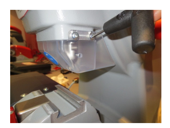
Loosen right side screws