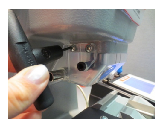
Loosen left side screws

Please return your original safety shield when you return your original console.